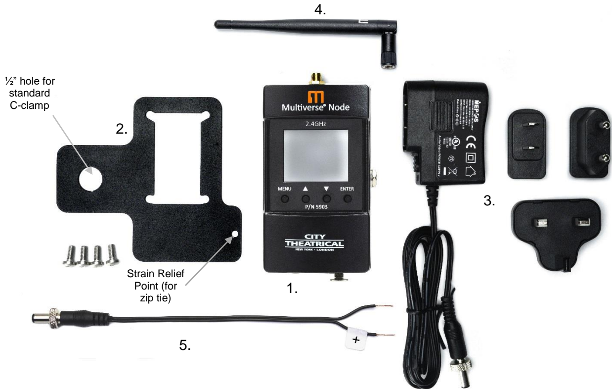
Figure 1: What's Included