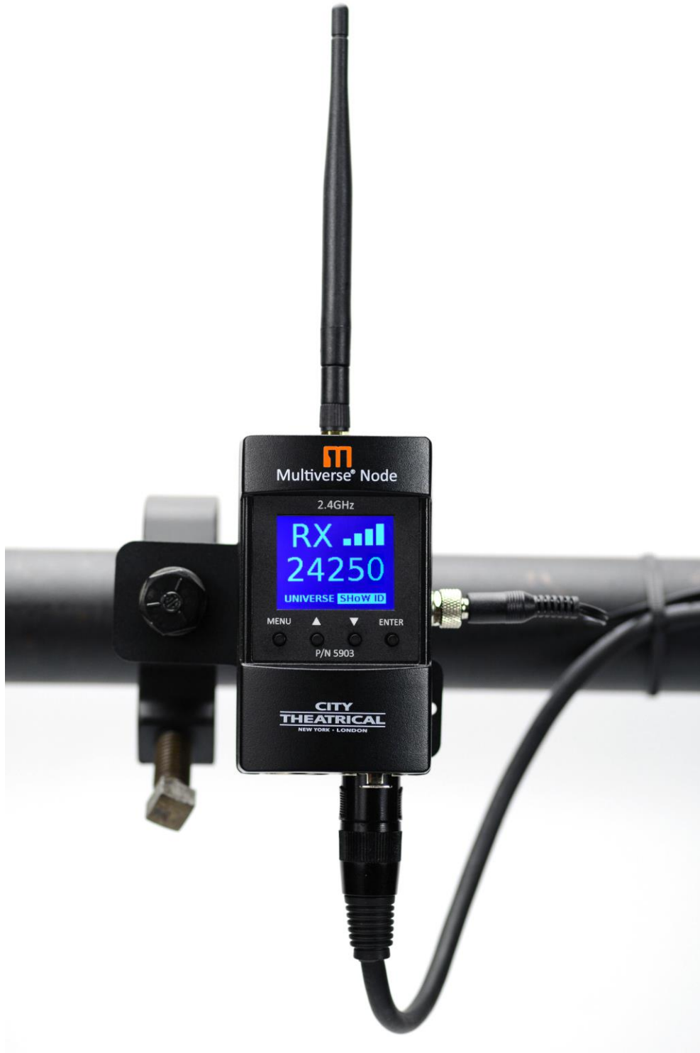
Figure 3: Pipe Mount